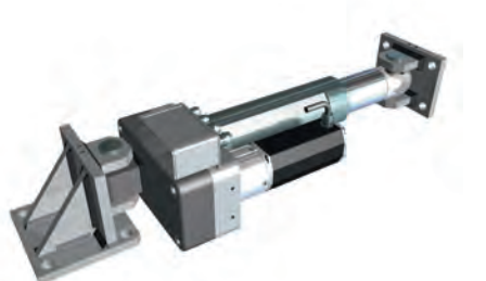
Actuator EMS 23 Up to 300 mm stroke with max. 9,000 N