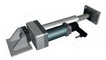
Actuator EMS 22 Up to 195 mm stroke with max. 2,250 N