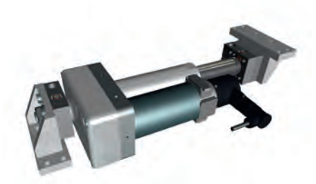
Actuator EMS 21 Up to 195 mm stroke with max. 1,680 N