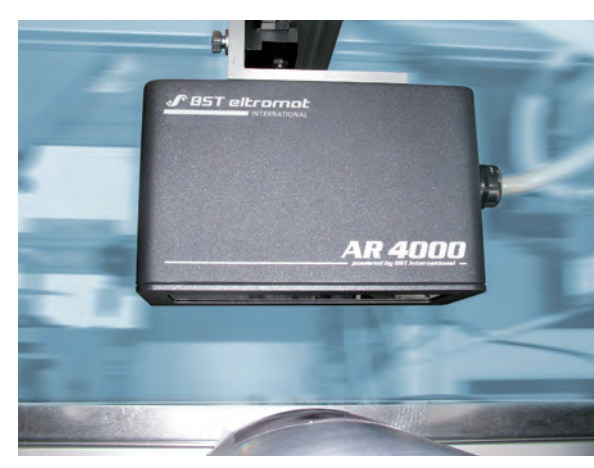
Compact measuring head