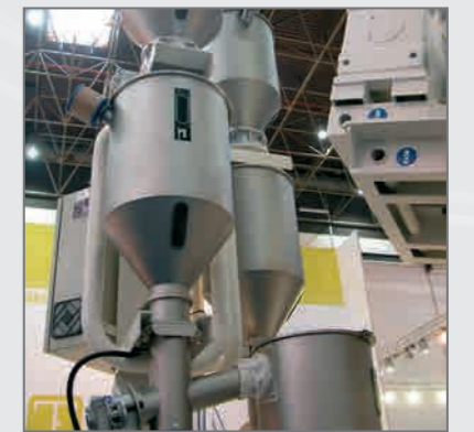
COMPO AF: FOR STARVE FEEDING EXTRUDERS