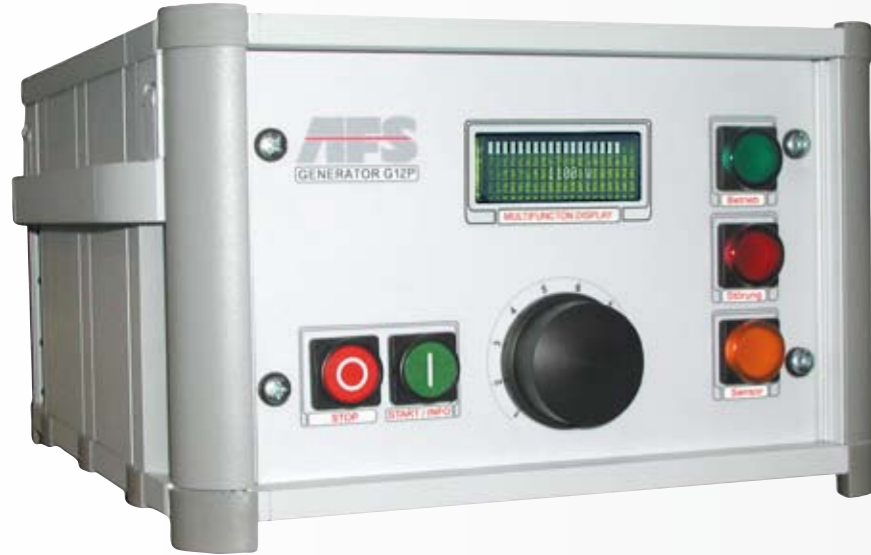
Plasma Generator G12 P

A powerful, yet compact generator, with an enormous range of functions. Its high efficiency, reliability, and simplicity of operation make it the perfect power source for all PlasmaJet® applications.