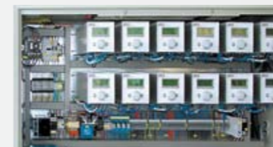
A combination of G05P generators

This technology is also perfectly suited to welding plastic webs and contours.