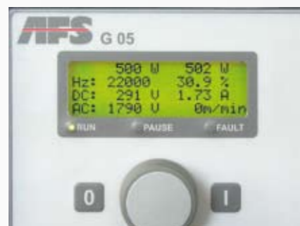
Plasma Generator G05P

effects of the plasma beam on the material surface. The results include chemical modification to the polymer surface through the combination of oxygen molecules. A cleaning effect is also realised by the destruction of surface contaminants. Functional nanosubstrates can also be produced using a suitable choice of the process gas.