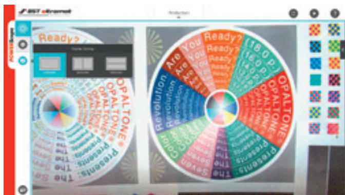
The intuitive POWERScope 5000 touch screen user interface "Production Display Settings Menu".

POWERScope 5000 is fully mechanically compatible with the POWERScope 3000 and POWERScope 4000 predecessor systems without the need for any press frame modifications.