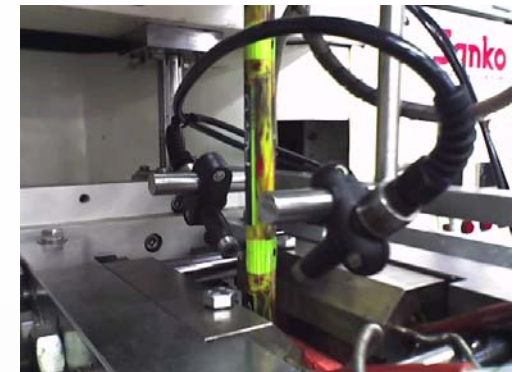
Vertical form filling of liquids requires the same equipment solution.

The 1250-S Bars should be just above the top position of the horizontal sealer.