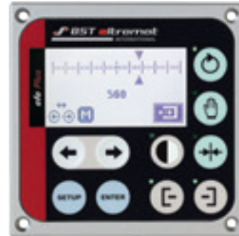
Remote control in the machine

Due to either the conditions of the machine or production requirements, it may be necessary for the web position to be corrected at a location distant from the actuator. An electronic remote control permits correction of web position and operation of basic functions from any place in the machine.