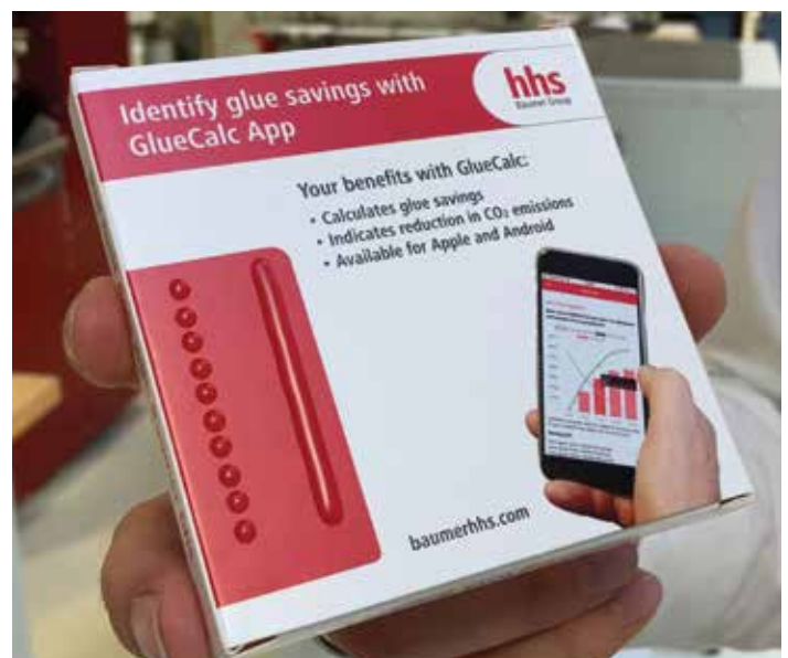
Dot application saves resources and costs